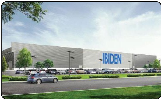
PCB Factory At Batu Kawan, Penang.