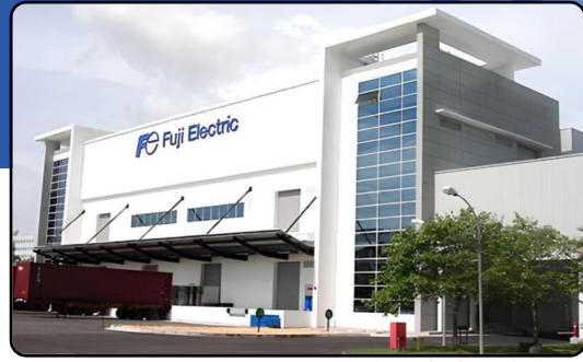
Semiconductor Factory At Kulim Hi-Tech Park, Kedah.