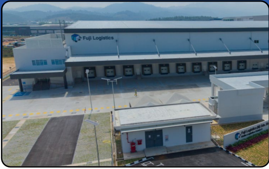
Warehouse At Kulim Hi-Tech Park, Kedah.